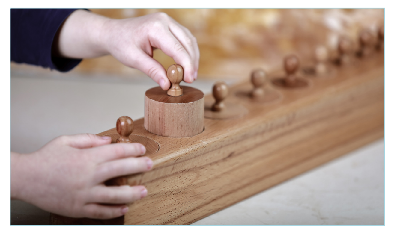
1 American Montessori Society; https://amshq.org/About-Montessori/What-Is-Montessori

Fidelity to the Montessori Method is paramount to maintaining distinction within the educational landscape of the Waco community. The American Montessori Society recognizes five components as critical to high-fidelity implementation of the Montessori Method — trained Montessori teachers, the multi-age classroom, using Montessori materials, child-directed work, and uninterrupted work periods. When guided in a truly Montessori learning environment, students soar "as confident, enthusiastic, and self-directed learners and citizens, accountable to both themselves and their community. They think critically, work collaboratively, and act boldly and with integrity."<sub>1</sub>